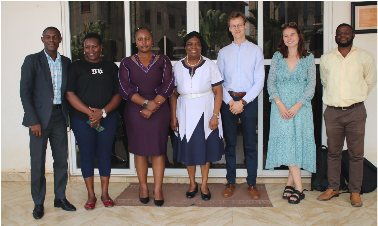
HRCU hosts a team from ASF