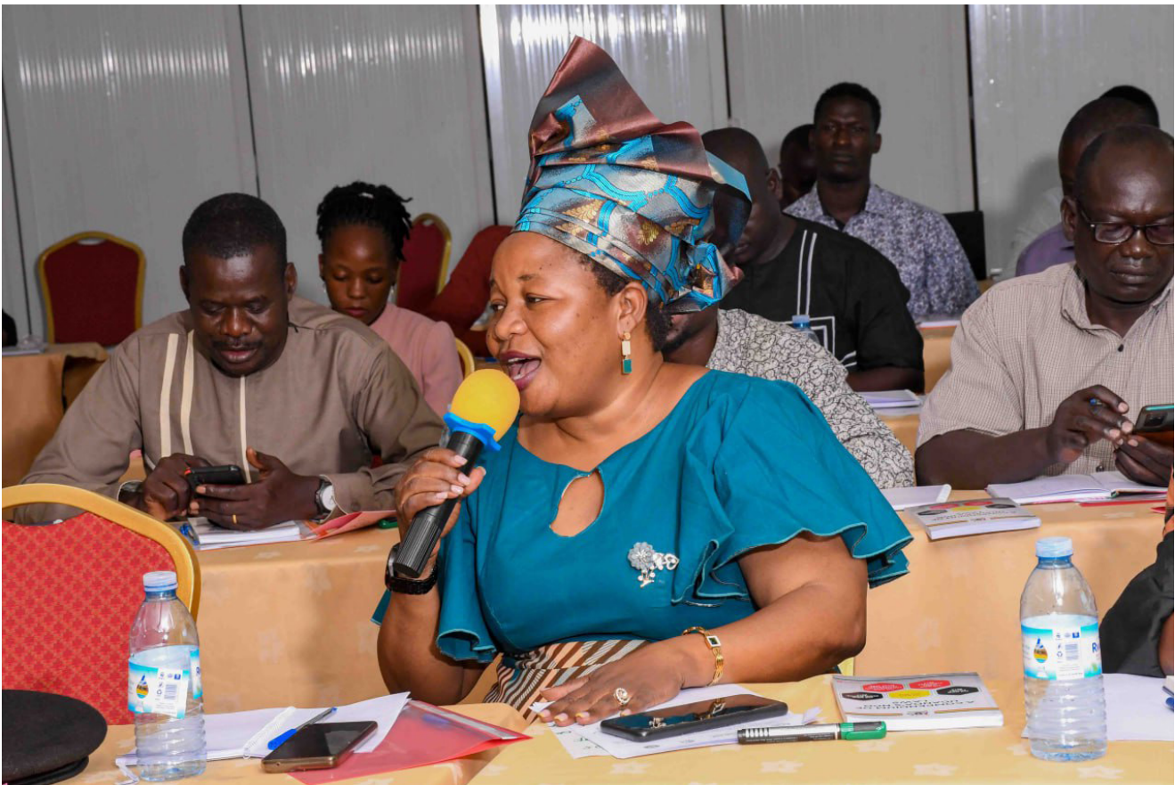
Gulu Reflection Meeting