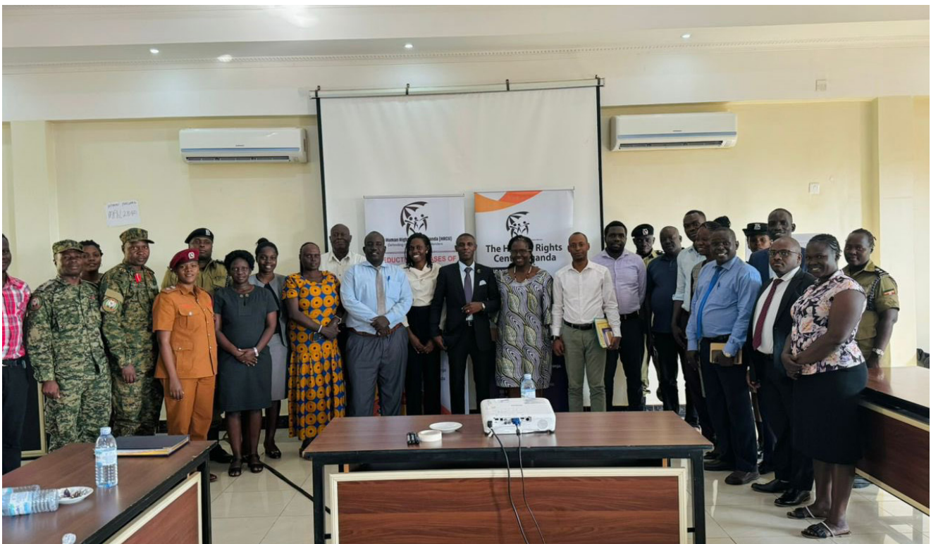
Stakeholders pose for a group photo during the workshop training

This workshop, held on 5th and 6th March 2024 in Lira city brought together a total of 30 (13 M and 17F) passionate HRDs and stakeholders committed to advancing human rights and fundamental freedoms. These included key government institutions such as Uganda Police Force; Uganda Prisons Service; Uganda Peoples' Defence Forces; Uganda Human Rights Commission; Local Government and civil society organisations. The primary aim of the workshop was to deepen the understanding of Human Rights Defenders (HRDs) and Duty Bearers regarding the Human Rights Based Approach to implementation of laws and human rights standards. Duty bearers also had time to interact and share experiences which enabled them to enhance collaboration and strengthen the referral pathway for promotion and protection of human rights in Northern Uganda.