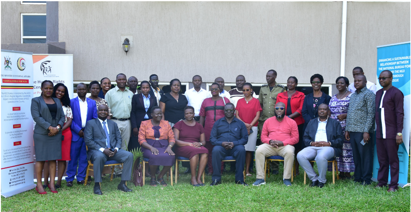
Some of the participants during the reflection meeting in Mbale district