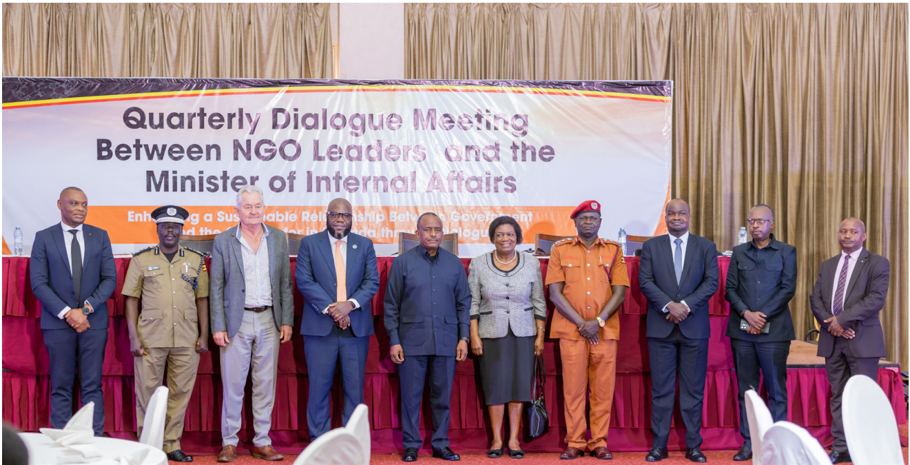
A group photo of some of the high-level attendees at the quarterly Dialogue meeting.