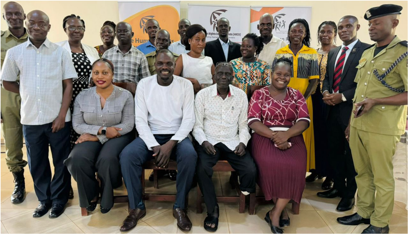
Stakeholders during the workshop training in Pader district.