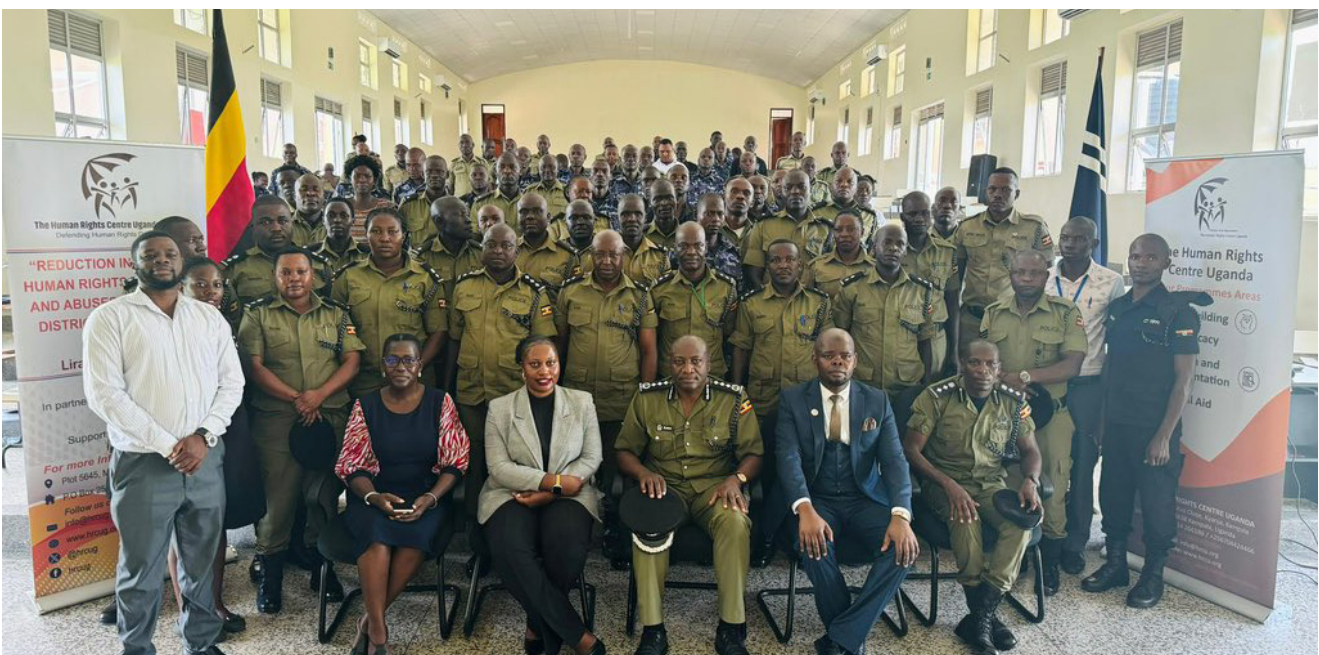
Photo| Group photo of police officers during the training at Kabalye Police Training School

The second workshop for Police officers was organized and conducted on 12th and 13th June 2024 at Counter Terrorism Police Training School, Olilim in Katakwi District. It was attended by eighty (80) Police officers